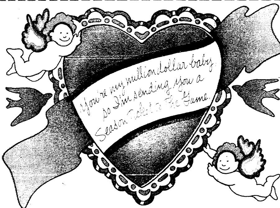
Clip along dotted line

Season Tickets are available for $5, $10, or $25. Get your applications wherever regular Game Tickets are sold, or fill out the application form below. And to let your Valentine know that a ticket is on the way, just cut out the printed greeting and send it along with your card.